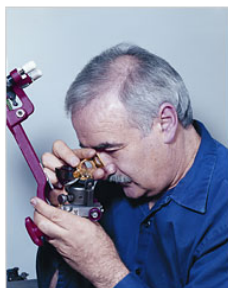
Safidco USA Inc.